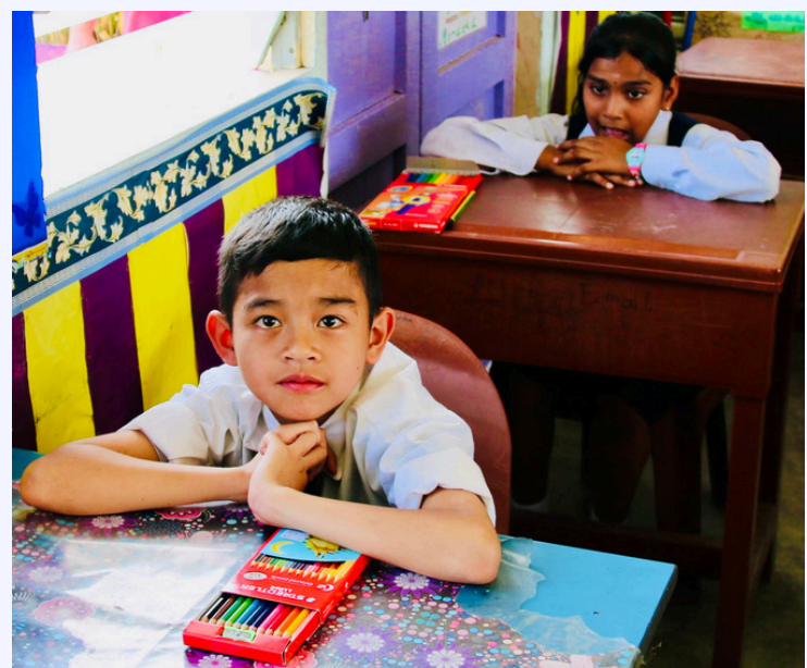
Eager Learners: EWRF students ready for a creative session in class.