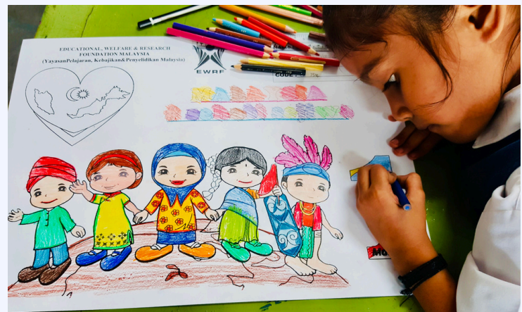
EWRF Student learning language through art at English for Juniors (E4J)