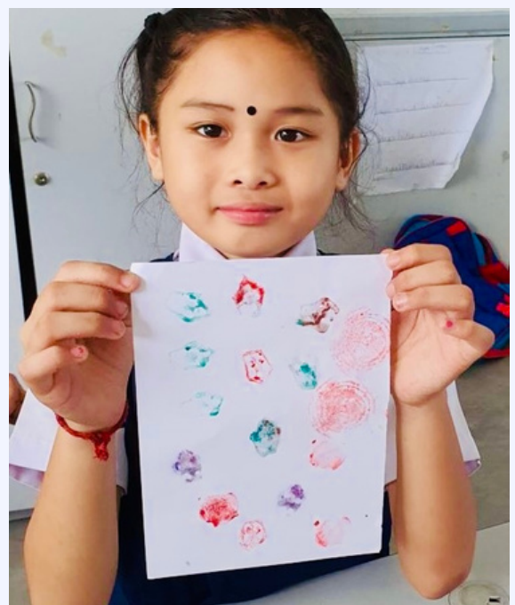
Proud Moment: An EWRF student showcases her vibrant artwork

Our branches and centres have been bustling with activity. On May 15th, 2024, the Kulai Education Centre (KEC) conducted a flawless practice session for Thevaram & Thiruvagam, providing an enriching cultural experience for the participating students. Meanwhile, in Hulu Selangor , chess enthusiasts gathered for some intellectual wizardry, and on May 30th, the IPTA 1st Choice 2024 convention drew over 40 enthusiastic participants.